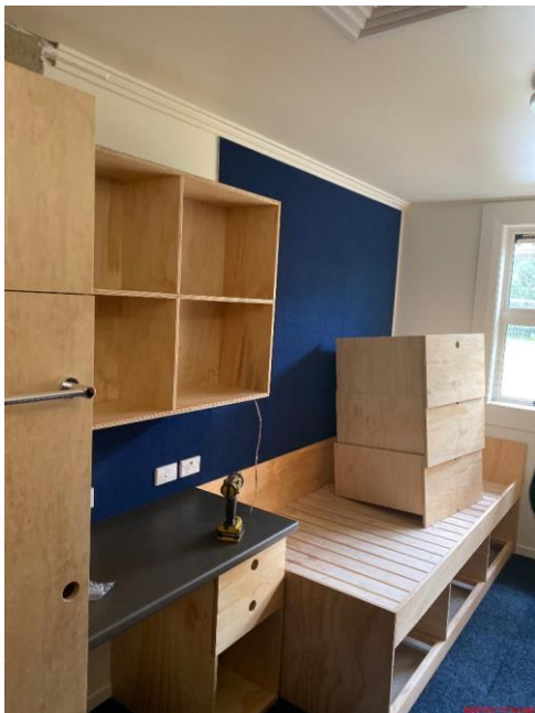
Dormitory upgrade at Repton House

The ablutions in Classroom Block A at Rathkeale are being upgraded into a gender-neutral facility that can be used by students, staff, parents, whanau and other visitors. The anticipated completion date is April 2023.