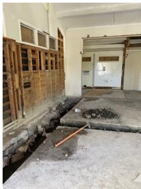
Ablution upgrade at Rathkeale