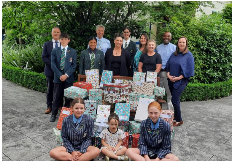
In November, Trinity staff and students supported Shoebox Christmas Aotearoa.

Our Trinity family strives to put God's love in action. Various fundraising and community projects have been undertaken by students, staff and families during 2022. The Shoebox Christmas Aotearoa project was one example where all Trinity entities united and contributed 47 shoeboxes, filled with Christmas gifts, to local Wairarapa children who can do with an extra smile on Christmas Day.