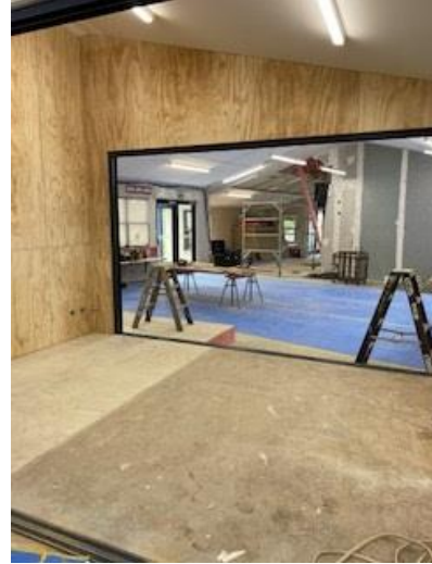
Hub 1 and 2 upgrade at Hadlow

The upgrade of the Repton Boarding House at Rathkeale is progressing well and all dormitories will be occupied by students at the start of Term 1, 2023. External work and the tutors' flat will be completed by April 2023. Our thanks to all those who have been disrupted temporarily by this major uplift in our boarding facilities.