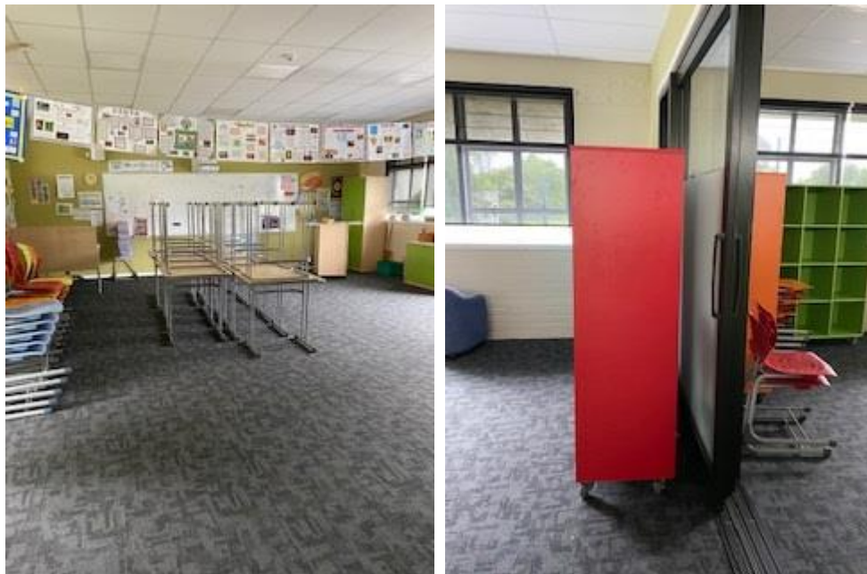
Refurbished intermediate classrooms in St Matthew's

The internal earthquake-strengthening and refurbishment of the St Matthew's Lower Classroom Block was completed at the start of 2022 and the Year 7 and 8 students and staff are enjoying the refreshed classrooms.